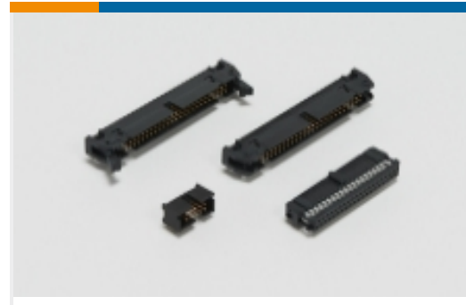
Ribbon Cable Connectors(4)